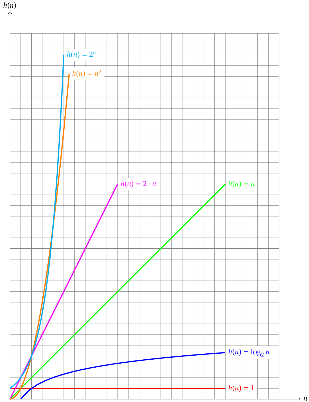
Figure 4: A graph illustrating the growth of several functions as the problem size is increased.